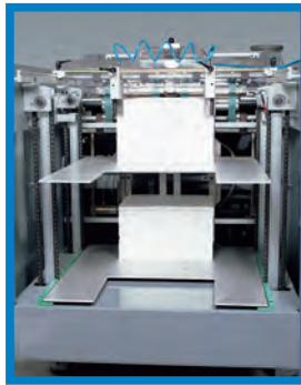
Paper feeding system.