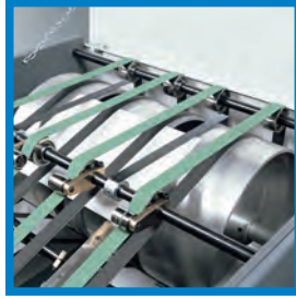
Sequence keeping device.